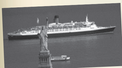
QUEEN ELIZABETH 2 in New York